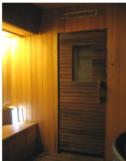
NEW CHANGEROOM LIGHTING IN THE SAUNATRUCK. NO MORE LOST SOCKS (THERE IS A DIMMER).