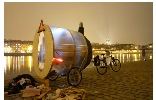
H3T BICYCLE SAUNA IN PRAGUE ON A NIGHT MISSION TO THE VLTAVA RIVERFRONT

Our friends at H3T Architects in Prague have built some truly innovative mobile saunas. We've been discussing a bicycle sauna trailer for a long time and we love their amazing design. We're planning to build one here to serve the East Van bicycle community.