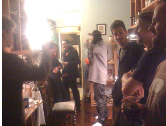
RELAXING AT THE SLIVOVICA HOUSE AFTER A MUSIC JAM AND A HOT SAUNA. SAUNASESSIONS 11TH ANNIVERSARY SWEAT ON JANUARY 1, 2012.

It was 11 years ago when we built our first mobile sauna, and what started as a winter impulse has developed into a community tradition. We're happy to announce that we've been officially recognized as a non-profit organization by the Registrar of Companies in BC as the BC Mobile Sauna Society. This new status will help us to continue to build on our mobile sauna success for many years to come.