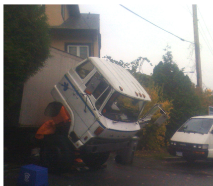
SAUNATRUCK FUEL INJECTION SYSTEM UNDER REPAIR AFTER THANKSGIVER.

to the sauna side of the vehicle. A new proper mobile shower attachment has replaced the many systems of garden hose showers used in the past. There's also small solar panel on the roof to help charge the batteries for newly installed lights in the changeroom, an essential upgrade to reduce the number of missing socks and bracelets.