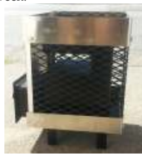
FIRST STOVE (2001, LEFT). CHICO FINISHES WELDING THE STOVE BODY (CENTER) NEW STOVE READY FOR INSTALLATION (RIGHT)