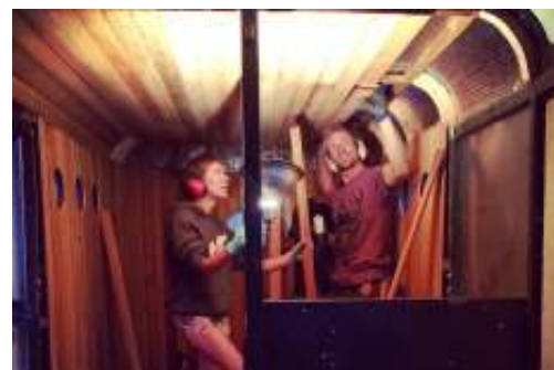
SH'BANG SHWEAT, A NEW MOBILE SAUNA IN BELLINGHAM