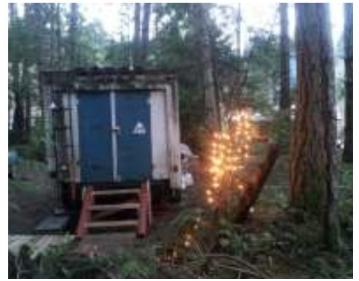
OUR SAUNAVAN TUCKED INTO THE WOODS ON GABRIOLA ISLAND.