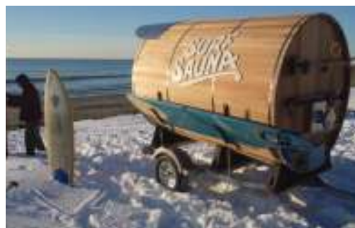
THE SURF SAUNA IN NEW HAMPSHIRE USA

It wasn't long after the launch event in February for our mobile sauna book that we began hearing about all new mobile saunas. The Surf Sauna is an amazing mobile barrel sauna in New Hampshire. Our friends in Bellingham built a new sauna in a old horse trailer in time for their Sh'bang festival in September. The mobile sauna book is available on Amazon.com and on our website.